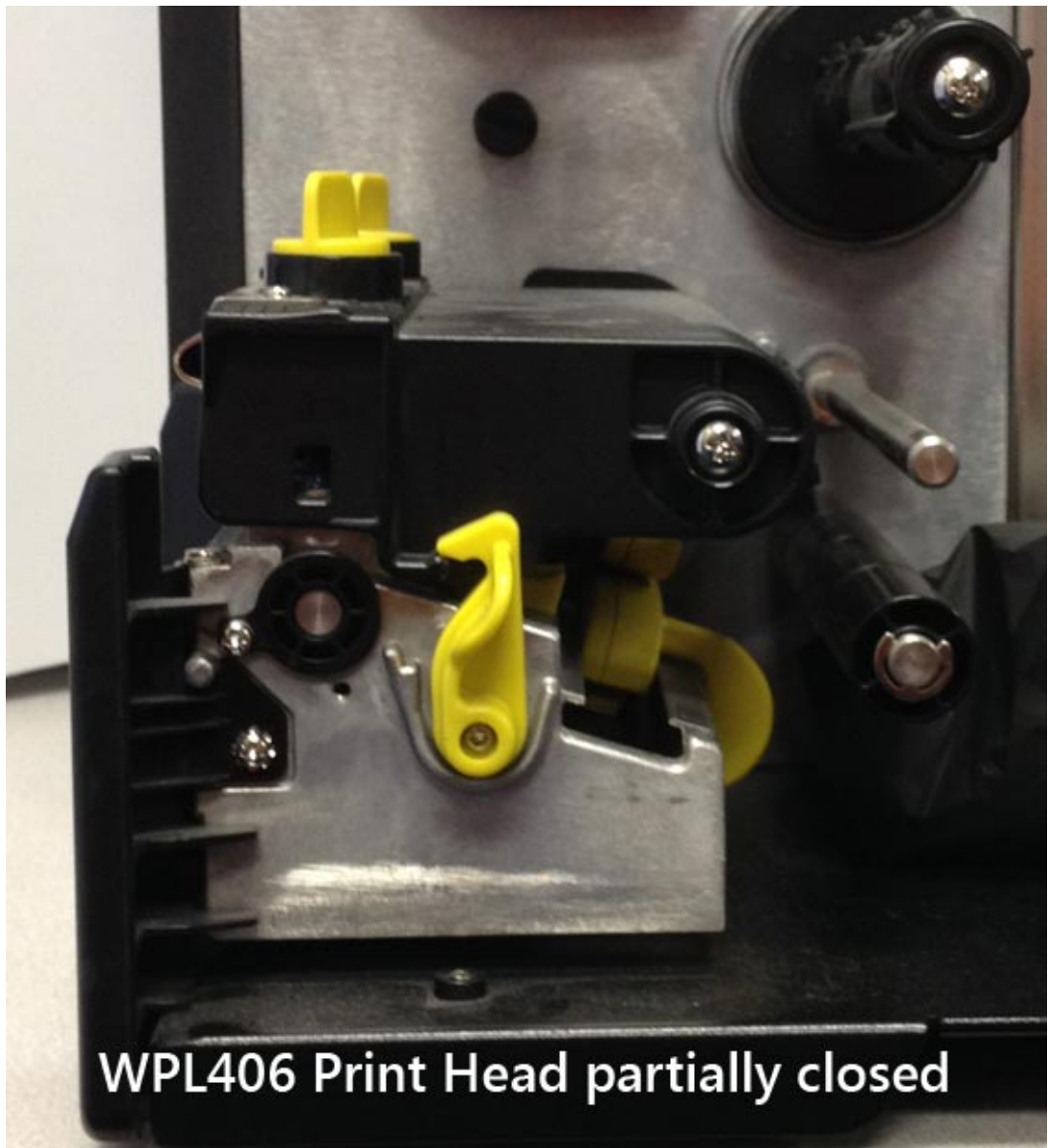
WPL406 Print Head partially closed