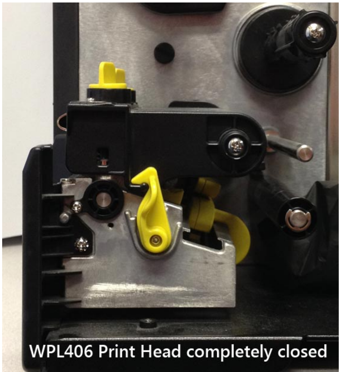
WPL406 Print Head completely closed